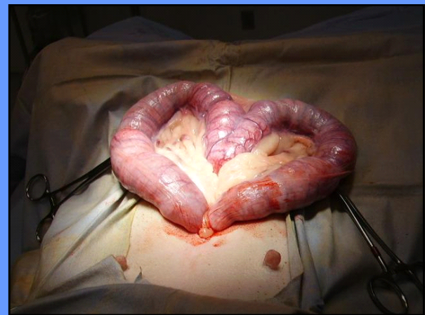
Surgery Revealed Pyometra